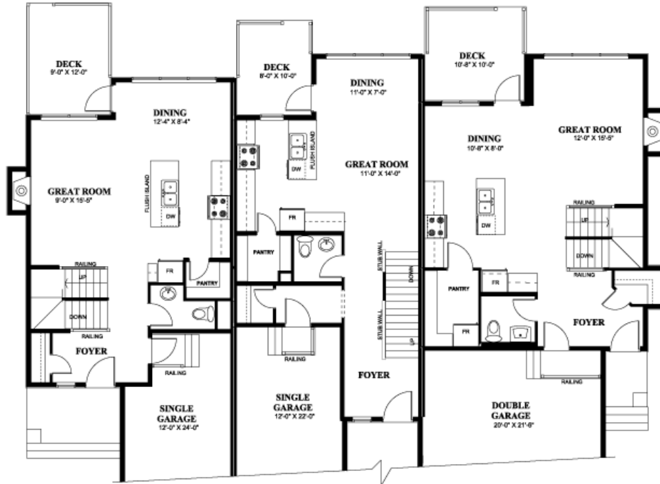
MAIN FLOOR 648 sq. ft.